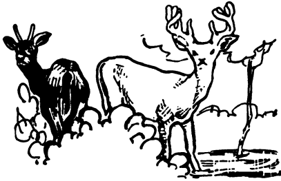
Too Many Deer