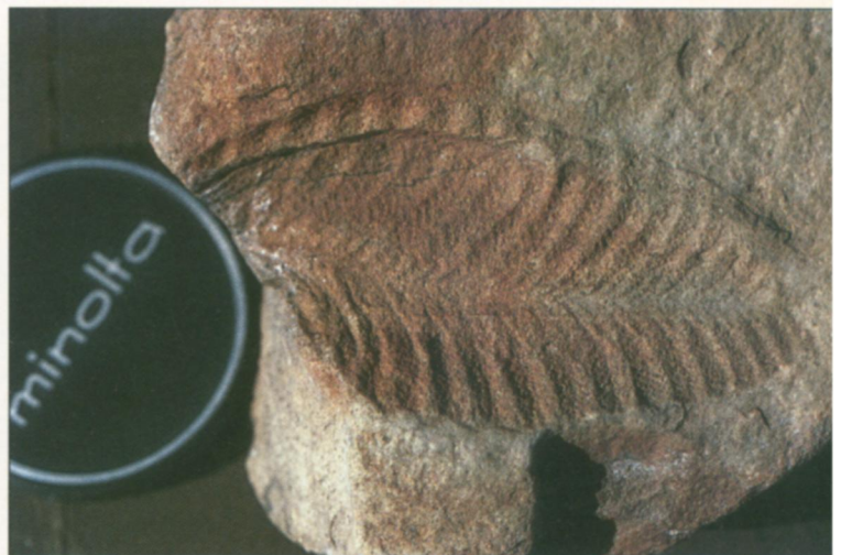
Tribrachidium , Phyllozoon , Rangaea by Runnegar; Nemiana by Jere Lipps and Mikhail A. Fedonkin

What are we? An Ediacaran wanted poster might feature Tribrachidium heraldicum from South Australia, Phyllozoon hansenii from South Australia, Rangaea schneiderhoehni from Namibia, and Nemiana from north Russia (shown clockwise from upper left). Because such fossils have extremely simple shapes, they can fit into many different biological categories, leaving scientists free to speculate about their classifications. Some forms, such as Tribrachidium , do not fit nicely into any category. Their bodies have a three fold symmetry unlike any seen in modern organisms.