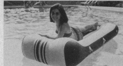
Floating in comfort high and dry: our Super Mattress!