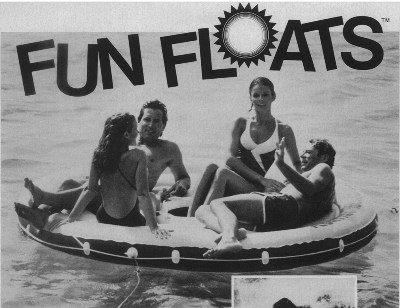
The Floating Island: room for even more fun!