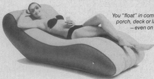
You "float" in comfort on porch, deck or lawn or —even on water!

Send now for FREE color brochure. Or, for faster service, phone: 516-724-8900. Office hours are from 8:30 AM to 4:30 PM, Eastern Standard Time.