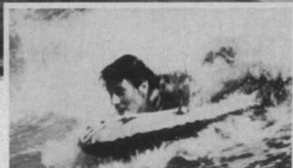
SE Surfer steers fast! The secret? A semi-rigid, molded keel!