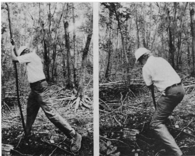
Peat can be 15 feet deep, as demonstrated with pole.

If the region is rich in history, it is even more abundant in legend. The best known legend originated in Nansemond tribal lore and concerns an