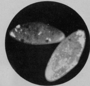
Darkfield unstained paramecium