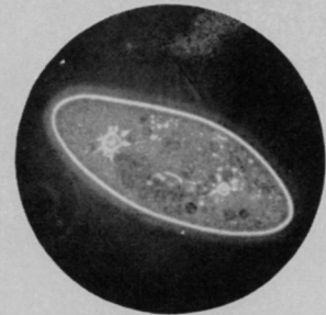
Phase Contrast unstained paramecium