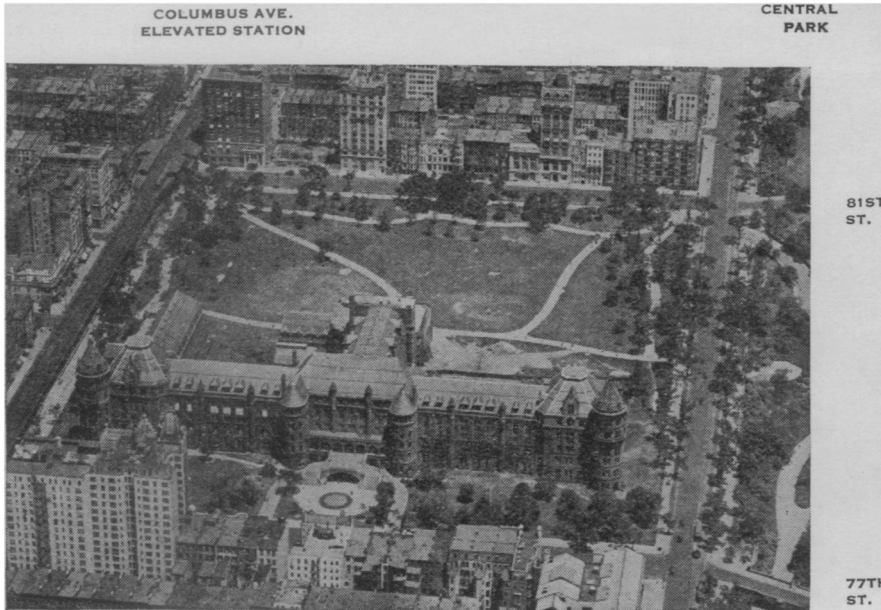
THE AMERICAN MUSEUM OF NATURAL HISTORY, as seen from the air shortly before the new wing was completed