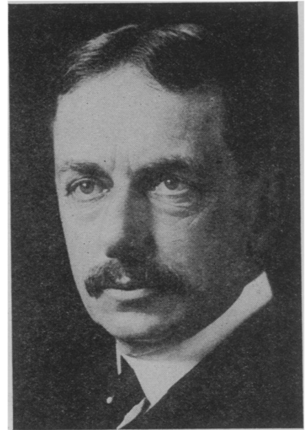
PROF. HENRY FAIRFIELD OSBORN, president of the American Museum of Natural History and of the American Association for the Advancement of Science

sity continuing to and alighting at 157th Street.